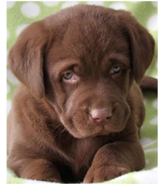
Family Puppy: Rudy (Docile, stays in home, loves music like Grandma, Krishna amused by "Snarky Puppy" go figure!!!)

http://youtu.be/fuhHU_BZXSk (Listen Up!!!)